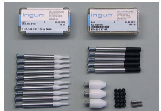
Start-up Kit Small