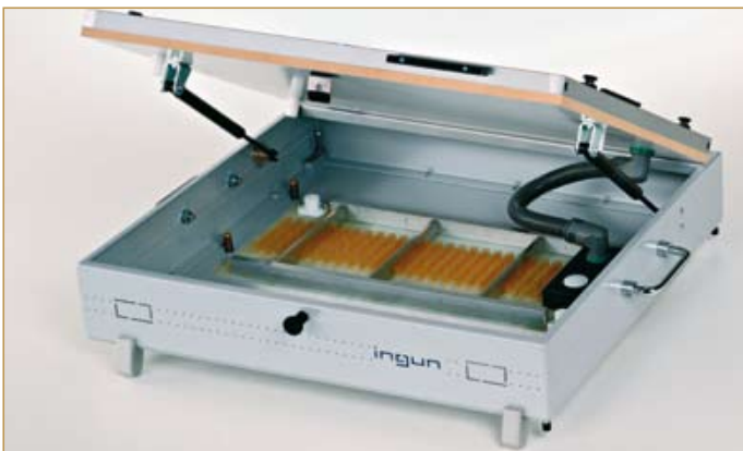
VA 2040/F/H/TD 885x-S

* The outside dimensions of the PC-Board can in some cases be larger than the stated usable area.