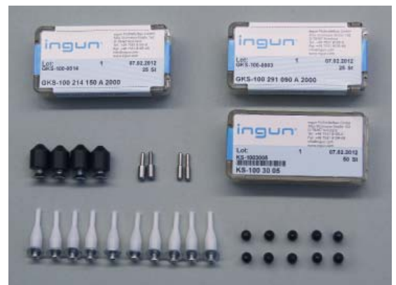
Start-up Kit for MA 160