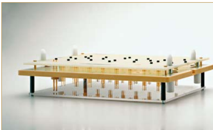
Probe Plate Unit KTE 2135