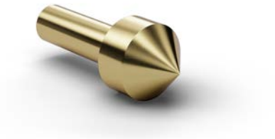
Tip style 1