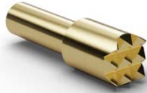
Tip style 1