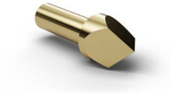
Tip style 1