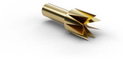
Tip style 1