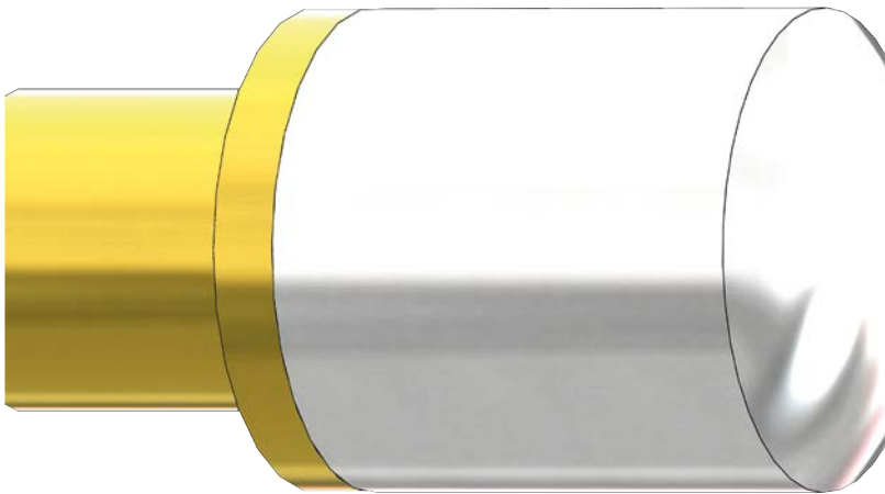
Tip style 1